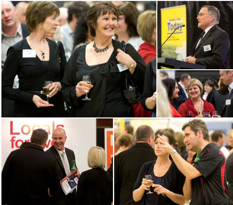
The Hawke's Bay Chamber of Commerce held Business After 5 at the Crown Hotel in Napier (first row below) and at Hawthorne House in Hastings recently (second row below).

The Westpac Chamber of Commerce Business Award Finalist Function was held recently at the UnisonFibre Hawke's Bay Business Expo in Ahuriri.